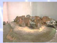
A scale reproduction of a Cucuteni (Iasi County) village -eneolithic period

-Part of the Cucuteni-Trypillia Culture - The First Civilization of Europe- (c. 5000 BC)