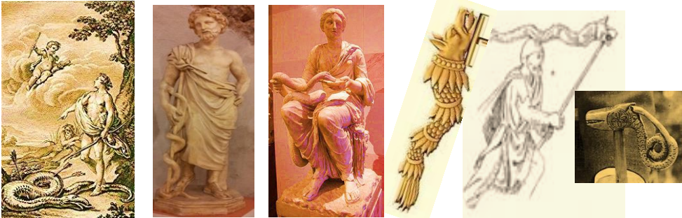
Apollo Asklepios Hygieia Dacian Flying Dragon