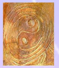
THE SNAKE - A REGENERATIVE SYMBOL, INCLUDING CYCLES, BIRTHS, DEATHS, REBIRTHS