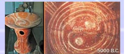
Similarities Cucuteni-Yangshao Cultures