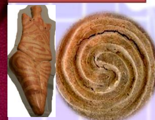
Cucuteni Pottery (5.000BC)