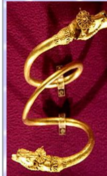
Dacian Bracelet from Iasi County, Romania (Cucuteni, 4th cent BC)