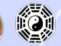
CHINA-Pa Kua, symbol